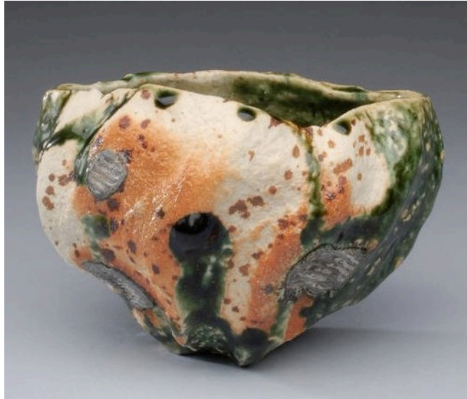
Sake cup by Inayoshi Osamu

(please see below for more detailed information)